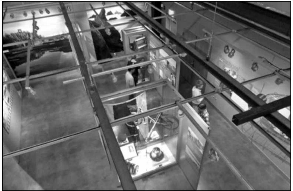
Cases in the exhibit hall are new and flexible. Artifacts shine with overhead lighting.

Learn about berry production, dairies, ranches, poultry, and farm economics. Compare and contrast local agriculture with farm life in America’s Dairyland, Wisconsin. Intriguing artifacts punctuate the exhibit, including a rare foot-pedaled milking machine and the oldest cattle brand still in use in Oregon. Children can “feed and groom a calf”