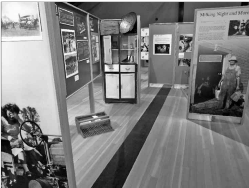
“Farm Life” is the theme of exhibits on the mezzanine.

Public hours are 10 am to 6 pm everyday except Mondays and major holidays. Museum members have free admission year-round. There are admission discounts for families, AAA, AARP, and active-duty service members.