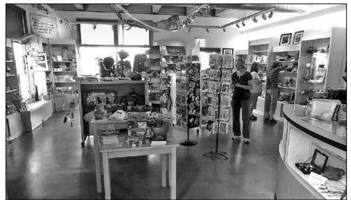
The welcoming new Coos History Museum Store.