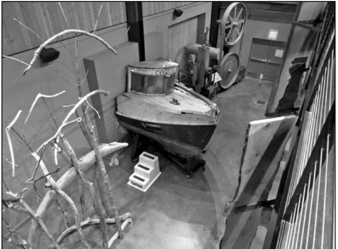
Large objects and tall planks of local wood greet visitors upon the entrance to the exhibit hall.