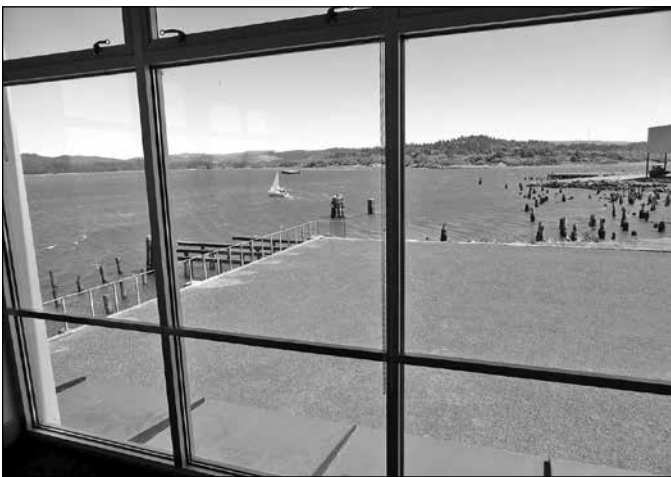
A view from the Lansing Research Room.