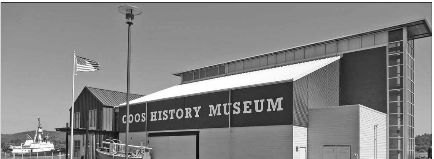
A Sause Bros. tug passing the museum August 18.